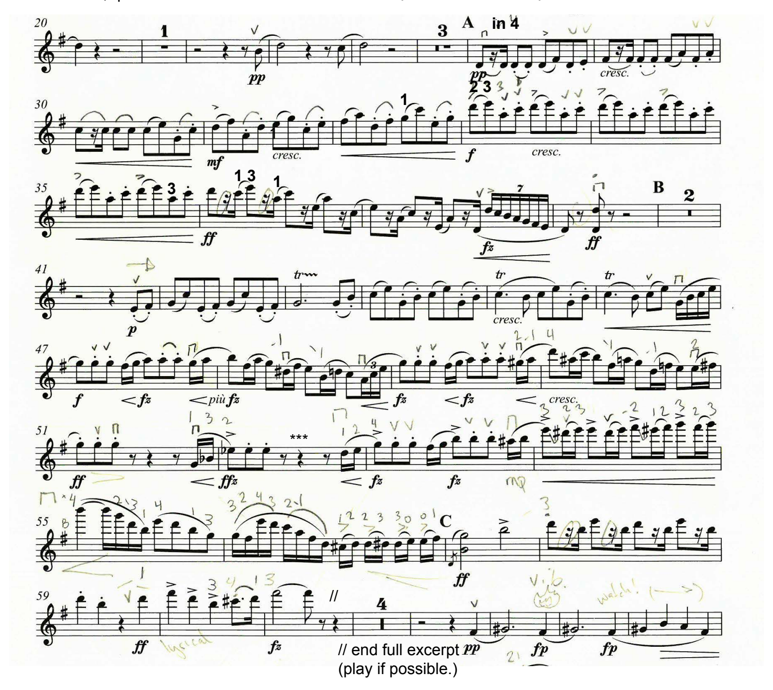
4/4 time, quarter note = 138 BEGIN AT m. 28 (rehearsal letter A.)

***optional stop, after 3rd note of m 52, if remainder of excerpt is outside your range.